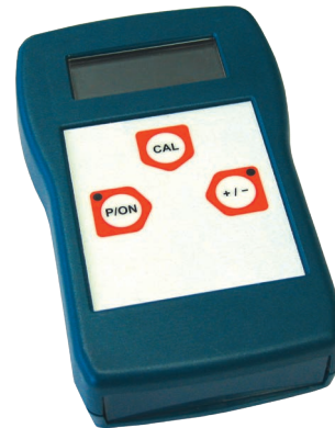
Hand-held strain gauge measuring instrument, model E3906