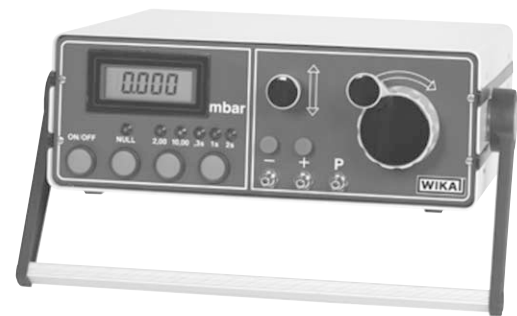
Low Pressure Calibrator CPC 2090